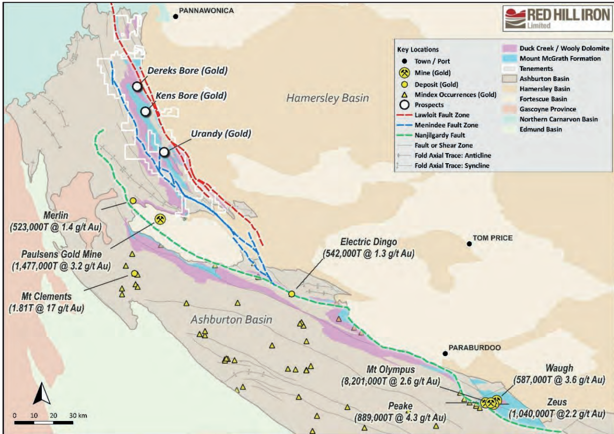
Figure 1: The Ashburton Basin showing the Red Hill Iron Project Area